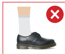
Socks too high, shoes are good