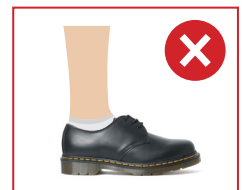
Socks too low, shoes are good

It is important to wear the correct shoes from an Occupational Health & Safety viewpoint. A neat and tidy uniform represents the College in a positive light.